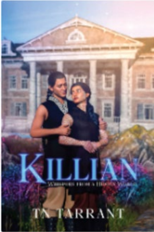
Science Fiction Romance